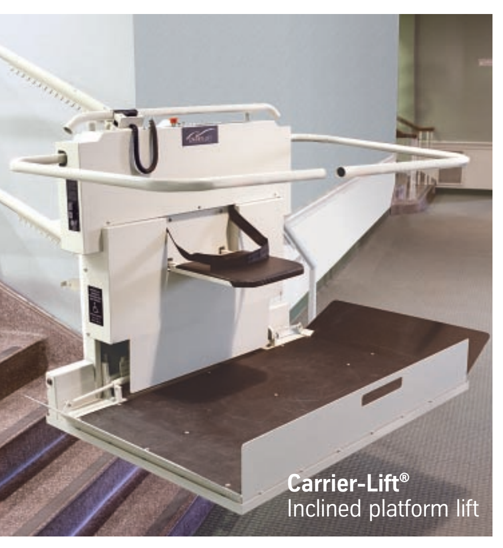
Optional fold-down seat

The Carrier-Lift® inclined platform lift is a complete accessibility solution for facilities that have limited space and budgets. The lift glides along existing stairs, providing open access to all levels without requiring structural changes. When not in use, the lift folds against the wall, leaving open valuable space.