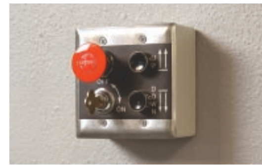
Optional remote controls ensure the lift will always be available for use. Add optional audible alerts and indication lights to signal the lift is moving.

multiple flights. The rack and pinion drive system ensures a smooth, quiet ride. We also offer battery-operated systems with "smart charge" batteries which continuously charge, ensuring the lift will always operate, even in the event of a power outage.