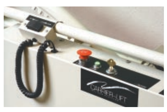
Operating controls A user or attendant can operate the lift using a flexible hand-held pendant control.

We engineer all of our lifts for your safety and comfort. They fully comply with ADA accessibility regulations. Each rail is custom manufactured to the exact contours of your stairway... whether straight, curved, spiral, or